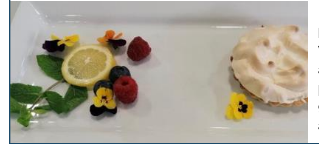
Food students have been baking. Wonderful cooking and beautiful presentation, guaranteed to make anyone feel hungry.